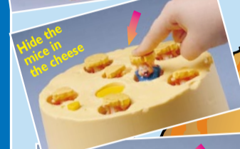
Hide the mice in the cheese