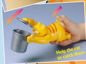
Help the cat to catch them!