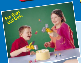
For Boys and Girls

For 2 Players. Choose your colours and see who can catch the most Mice!